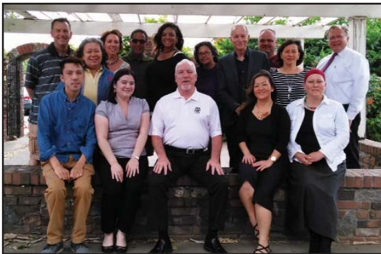
2018 COOK REALTY CHARITABLE FOUNDATION GOLF TOURNAMENT COMMITTEE

5:00 DRINK AND DINNER COOK REALTY COURTYARD LIVE AUCTION AND RAFFLE FOLLOWING DINNER