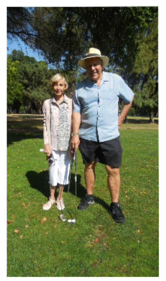
Friday September 21, 2018 William Land Park Municipal Golf Course